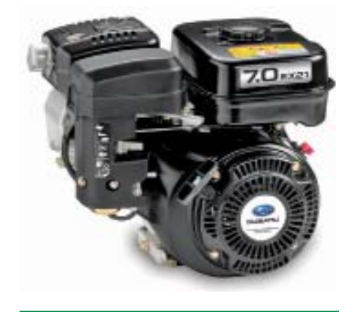
GOMACO CORP. Booth C5144

Subaru's EX Series engines are the first to utilize high performance chain-driven overhead cam (OHC) technology. Now equipped with a 5-year limited warranty, the engines offer power ranges from 4.5 to 9 hp, and easier starting and quieter operation than same-class competitive engines. The series includes the EX13, EX17, EX21 and EX27 models, which produce 4.5, 6, 7 and 9 hp respectively. www.subarupower.com