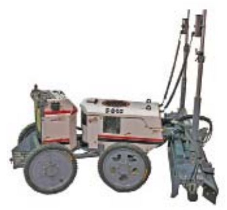
LOAD WARRIOR Booths C6785, O31566

The S-840 is a four-wheel, ride-on small laser screed. It allows contractors to exceed standard flatness and levelness at higher productivity rates—up to 5000 sq. ft/hr Offset auger head design allows for one-man operation, no rakers needed. It has three head options in both 6- and 8-ft widths—raking, subbase, and screed heads for better equipment utilization. 3D Profiler System compatible. www.somero.com