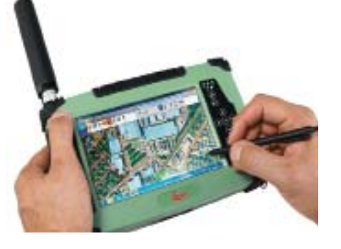
The Zeno CS25 GNSS is a tablet computer that has GNSS functionality in an

ergonomic and portable device with a large screen. The unit doesn't require a backpack or a pole mount, or any additional batteries. A compact antenna allows high accuracy data collection. The rugged tablet with its 7-in. display is easy to read and operate, even in brightest sunlight. The direct integration of GNSS into a tablet computer gives users full flexibility for efficient field data capture. www.leica-geosystems.us