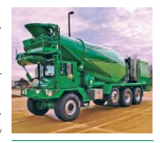
DOOSAN Booths C5487, O32031

and for easier roller position adjustment. A hanging step offers easier three-point access into the cab, and a new bolt-on ladder delivers direct access to the chute clean-out platform. www.terex.com